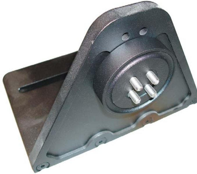
PT-250 camera bracket with spacer and bolts inserted

Assemble camera/lens combination. Find the center of balance of the camera/lens assembly and note its location. Attach camera/lens system onto camera bracket using the supplied 1/4"-20 fasteners. Do not completely tighten the fasteners until after the next step.